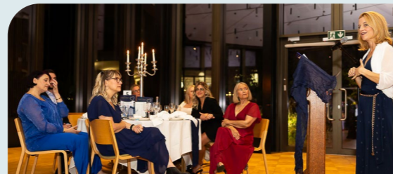
Presenting our first Golden Heart Awards in Oxford.