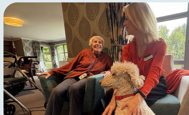
Visiting Merlewood on Waggy Wednesday.